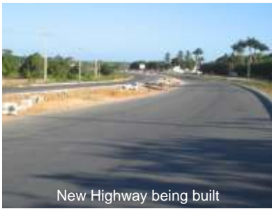
New Highway being built