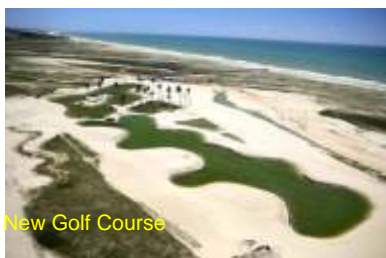
New Golf Course

Outside of the city has a multitude of spectacular sites, far too many to list but the jaw dropping beauty of the beaches in this municipality makes it clear why it is the location of the new 'Super-Resort' which in fact will be the largest resort in the whole of Latin America and will completely transform the economy of this municipality. The 10,000 jobs which it will create, not to mention the 700 million reais invested in implementing the project, will create a whole new energy in the municipality and in fact the 'feel good' factor has already begun with a plethora of other large scale developments following on the back of this. In fact this resort is going to be one of the most Ecologically Friendly Resorts in the world due to its sensitive location nestled in among the giagantic sand dunes, and the championship golf course will surely be one of the most spectacular ever seen.