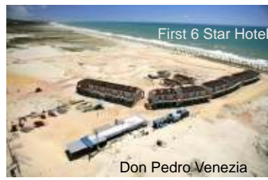
First 6 Star Hotel