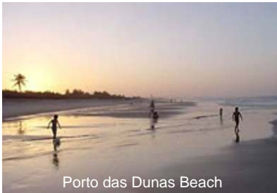
Porto das Dunas Beach

The government has also been generous in assisting all this new investment, with over 300 million reais being released for a new dual highway, infra-structure and an overpass to the new developments.