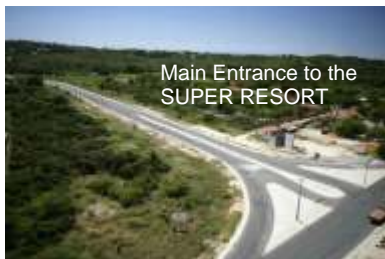
Main Entrance to the SUPER RESORT

The wonderful sweet scent of the tropical flowers fills your lungs as you stroll though the Praça das Flores (Flower Plaza) to the other side of the square. Here you can find various things to excite your curiosities including the Market of Arts and Crafts which are made by the locals. With only 67,000 inhabitants this is a truly authentic City with a small town feel and what better way to pass the day than to seat yourself in an outside restaurant or café and watch the world go by - and actually you could be forgiven for thinking that you are in the middle of an elaborate film set!