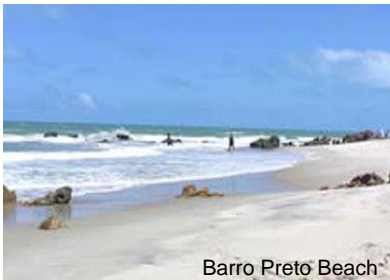
Barro Preto Beach

Aquiraz was already the main destination for Brazilians, both from Fortaleza and other parts of Brazil, with Porto das Dunas, home of the largest water park in Brazil, but these new developments will take it to a completely different level. Some of the other beaches in the municipality are Marambaia, Presidio, Iguape, Barro Preto and the most beautiful of all Prainha!!