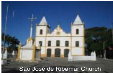
São José de Ribamar Church

Only 25 kilometers away from Fortaleza Aquiraz, which was the first capital city of Ceara for many years now plays second to its big brother. Its rich colonial past is very visible all around you in the city, but especially in the Historical Center. In this part you are surrounded by the brightly colored colonial facades, the most of which have been extremely well maintained and allow you to breath a little of its Portuguese history. Some of the buildings include the breathtaking 18 th century Church of Matriz de São José de Ribamar, the museum of sacred arts (which also was the first in Ceará) and the preserved ruins of the Jesuits all keep the memories of the past alive.