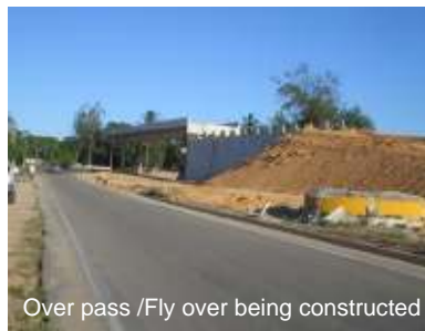
Over pass /Fly over being constructed